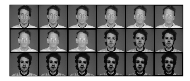
Figure 1: Responses of dilations and erosions for scales 1–9.

Figure 1 depicts the outputs of multiscale dilation-erosion for the scales that have been used. The first nine pictures starting from the upper left picture are dilated images and the remaining nine are eroded images. It is seen that multiscale dilation-erosion captures important information for the key facial features, e.g. the eyebrows, the eyes, the nose tip, the nostrils, the lips, the face contour etc. Let the su-